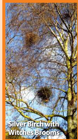
Silver Birch with Witches Brooms

A Silver Birch tree growing in the front garden of a house in St. Annes Crescent, Gorleston has several odd-looking distortions with masses of twigs and branches resembling birds nests, however these are not nests, but are called "Witches Brooms" and are a symptom of distress caused by various mites, fungi, aphids and diseases which results in a deformity, and nothing to do with Witches! Trees such as Ash, Pine and Willow can also have symptoms. During one of my trips to the U.S.A. I observed some Witches Broom on a Hackberry tree, also called a Sugarberry, many birds consume its sweetish berries, including the Cedar Waxwing ( Bombycilla cedrorum ) different from the Waxwings that visit us here.