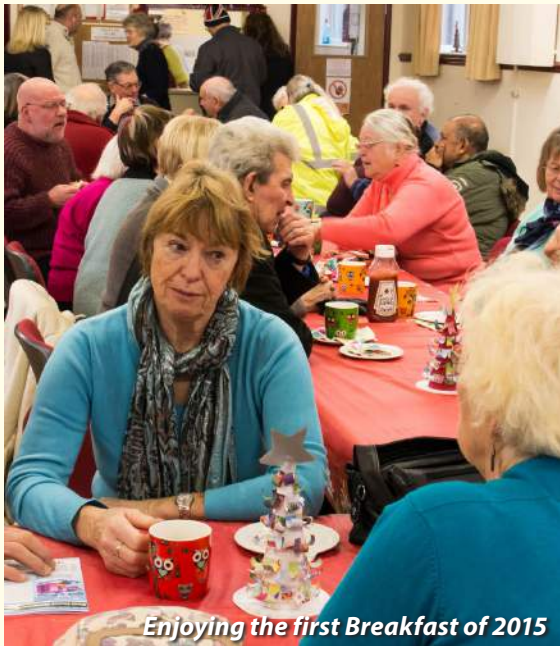
Enjoying the first Breakfast of 2015