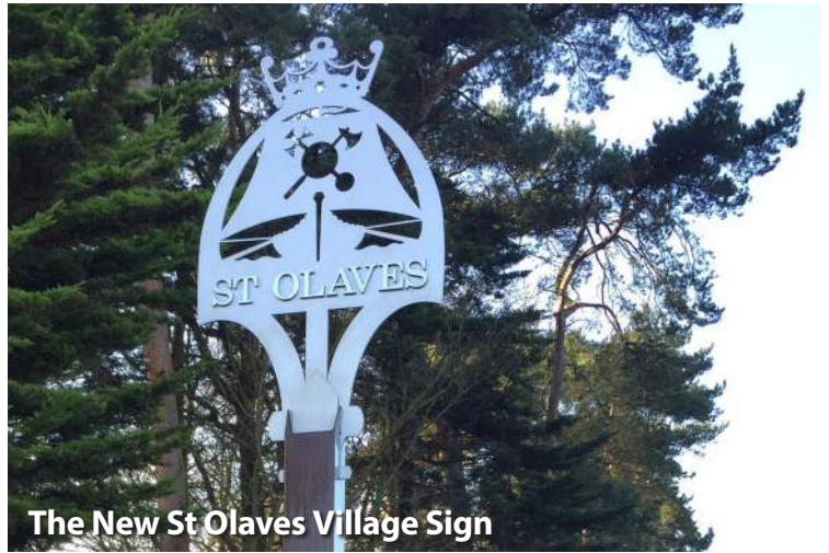
The New St Olaves Village Sign

By developing a new relationship with the conditions we find ourselves in we begin to respond creatively. Experiences don't overwhelm us and we can remain steady through life's ups and downs. Mindfulness isn't a cool and detached awareness though - it's warm, gentle, and kind. Towards the end of the course we'll introduce a kindness meditation, which will help you to develop this aspect of mindfulness further. Like mindfulness, kindness has been proven to reduce levels of stress. The Mindfulness for Stress Course is for everyday experiences of stress and is not suitable for people experiencing deep rooted depression. Please feel free to confidentially discuss your situation with me to decide if this is the right course for you on 07557141869. This course is for anyone experiencing day to day stress, or wanting to learn strategies to deal with the general complexity and pace of modern life.