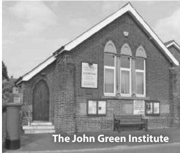
The John Green Institute