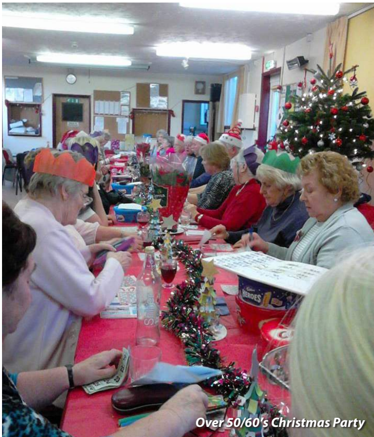
Over 50/60's Christmas Party